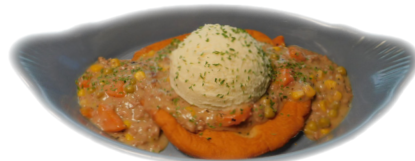
Fry Bread Shepherd's Pie